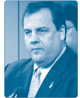
gobernador Chris Christie

Una segunda ronda de mediados de los años recisiones entrará en vigor en el ejercicio