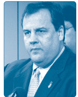
Governor Chris Christie

A second round of mid-year recisions will take effect in the current budget year