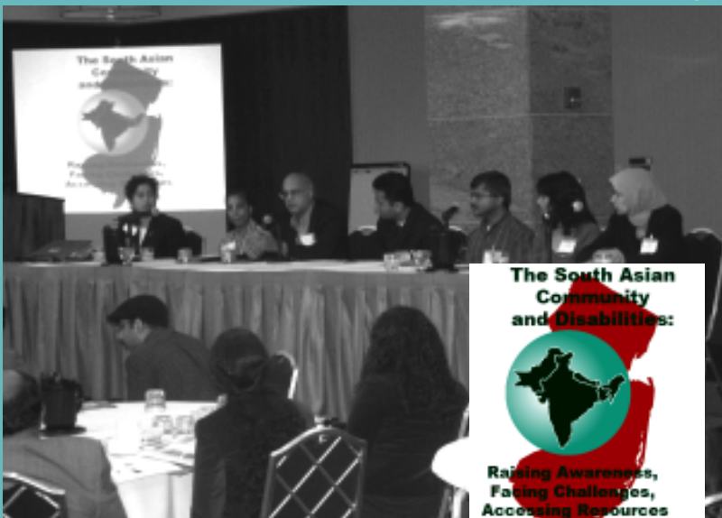
2007 Asian Issues Conference: Co-sponsored by NJCDD, Boggs Center-NJUCED and NJP&A

The organizations who have been collaborating to sponsor these cultural awareness days are exploring similar events focusing on Asian Pacific and Middle-Eastern communities in New Jersey.